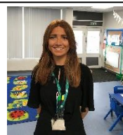
Miss Trainer Teacher RLT

We will continue to practise forming letters with control. The children will be practising writing short words, phrases and sentences, beginning to think about finger spaces, capital letters and full stops.